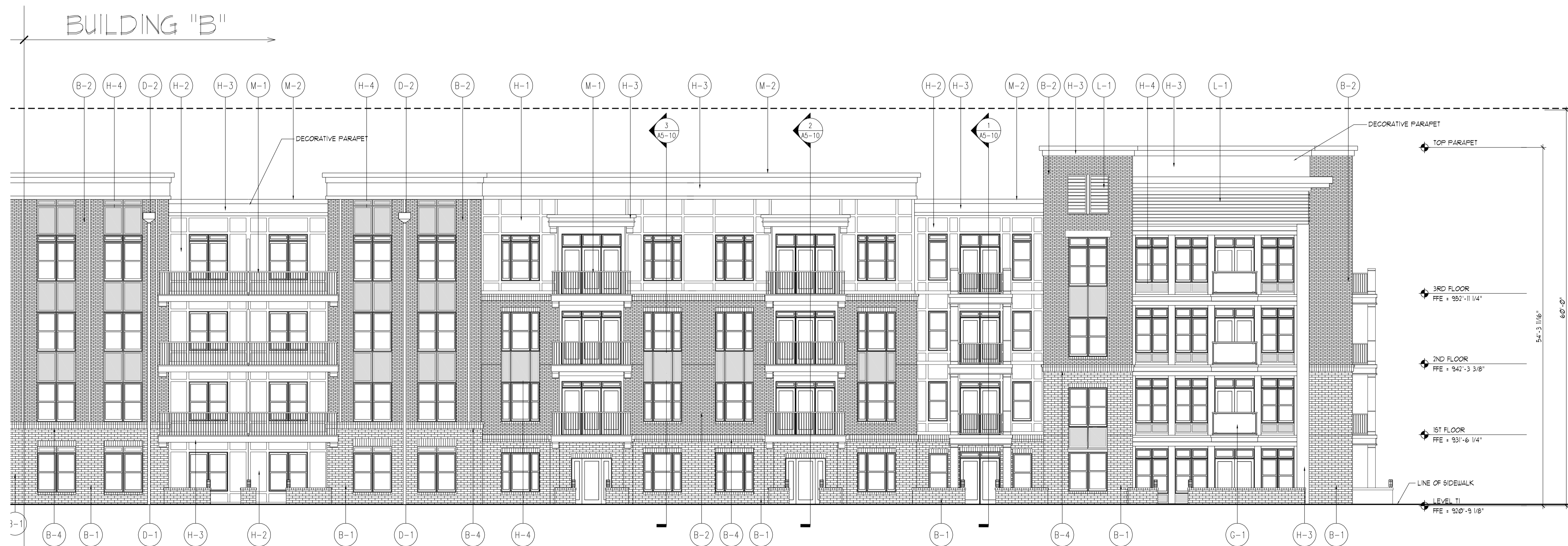
1 DRESDEN ELEVATION AT BUILDING 'B' SCALE: 1/8" = 1'-0"