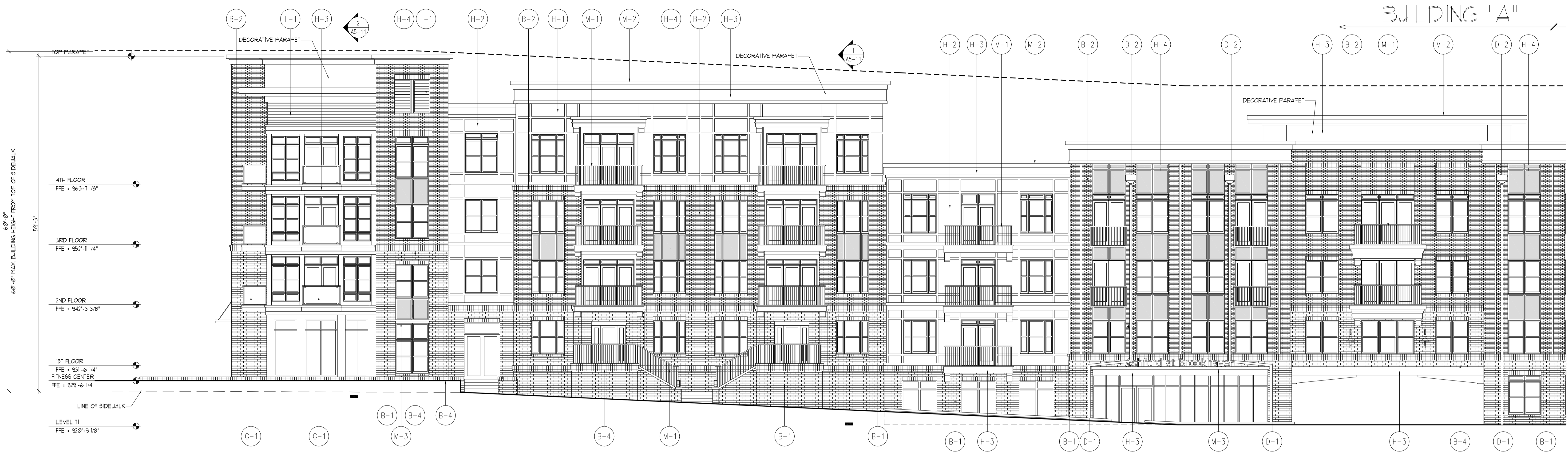
2 DRESDEN ELEVATION AT BUILDING 'A' SCALE: 1/8" = 1'-0"